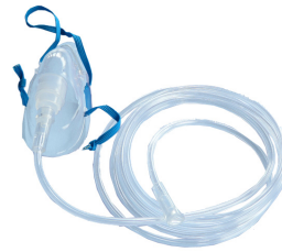
Zuurstof & aerosol therapie