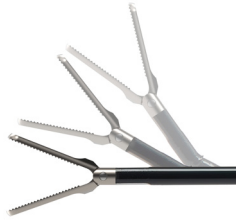
Articulerende lap. instrumenten