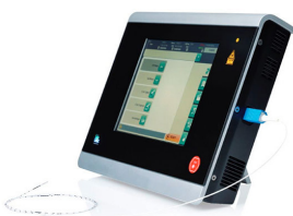
Minimaal invasieve laserprocedure