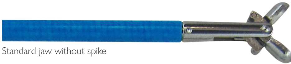
Standard jaw without spike