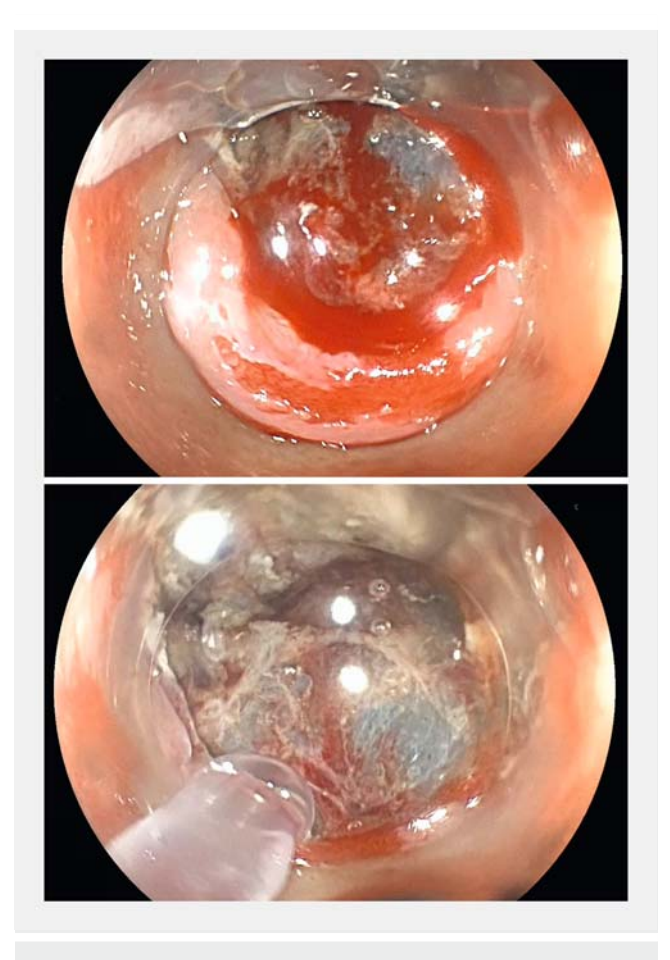
Fig.1 Endoscopic views showing the application of Purastat for intraprocedural bleeding.

All patients undergoing esophageal ESD received high dose proton pump inhibitor therapy (40 mg twice daily omeprazole or equivalent) for 8 weeks post-procedure. All patients returned approximately 4 weeks post-procedure for a repeat endoscopy to inspect the resection site. Complications or adverse events (delayed bleeding, perforation, unexpected hospital admissions) related to the ESD were recorded at this visit. Delayed