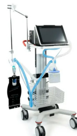
Adult IC - PICU Ventilator