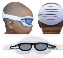
Maternal Infant Care