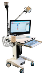
EEG & LTM