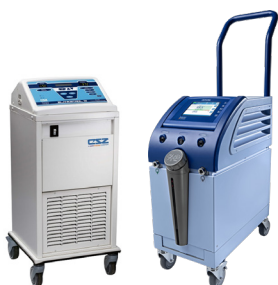
Patient Temperature Management