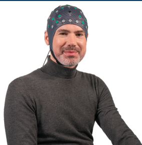
Accessories & Supplies