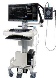
EMG & EP