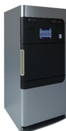
Low Temperature Sterilizer