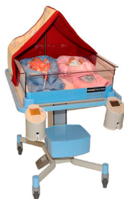
BabyBed & BabyWarmer