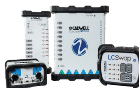
IntraOperative Neurophysiological Monitoring Cascade IOMAX