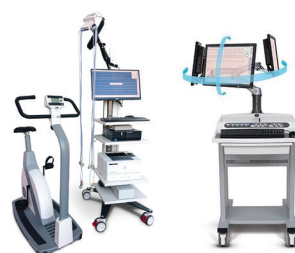
Stress ECG: eBIKE III met CARDIOSOFT - CASE