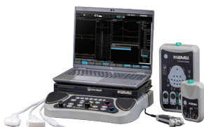
EMG - EP - Ultrasound Cadwell Sierra Summit