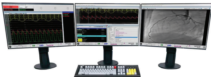
Hemodynamische metingen MAC-LAB BT22