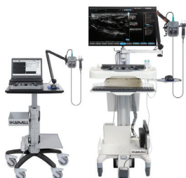
Electrodiagnostics on laptop or desktop