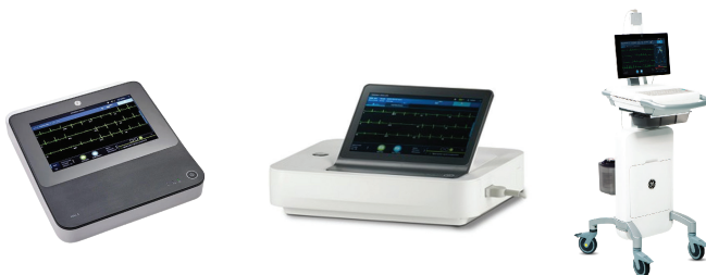
Rust ECG: MAC5 - MAC7 - MACVU360