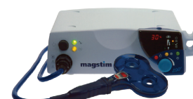
Magstim Magnetic Stimulation