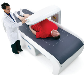
DXA Dual energy X-ray Absorptiometry