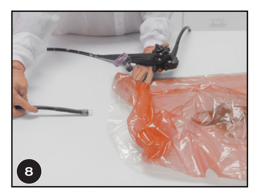
Deploy any remaining bands into biohazardous medical waste container.