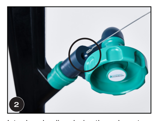
Introduce loading device through center of ligation handle and advance until tip of device exits endoscope.