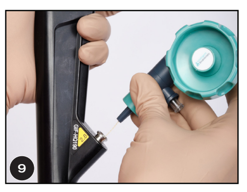
Remove handle and attached deployment cord from accessory channel.