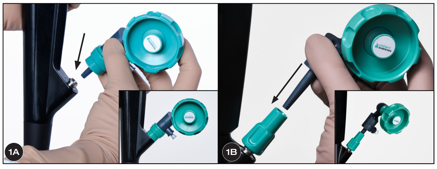
Insert handle stem through cap and into accessory channel.