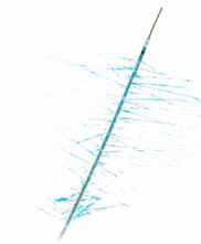
Infuuskatheter voor trombolysie