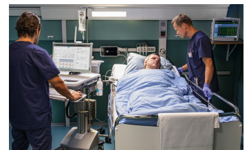
Centricity Neonatal Critical Care