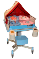
BabyBed & BabyWarmer