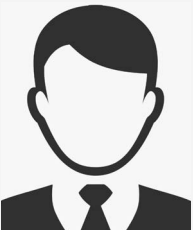
Open Position Account Manager Nord