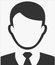
Open Position Account Manager Noord