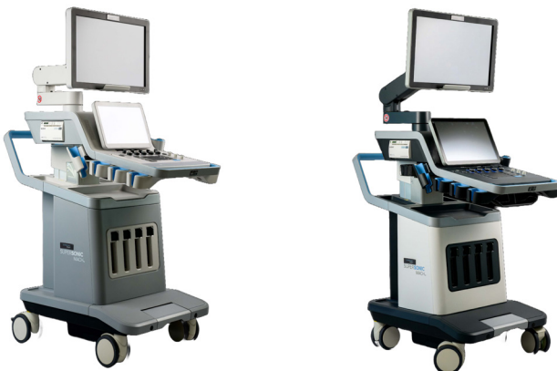
Super Sonic Imaging