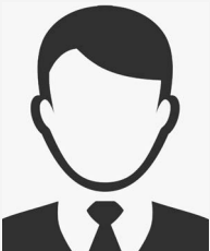
Open Position Account Manager Noord