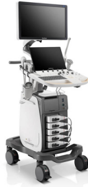
Endo Echo (EUS - EBUS)