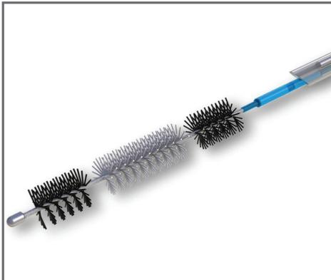
1. Infinity sampling device design

The Infinity sampling device was used to gather specimens from the targeted strictures. Using a therapeutic side-viewing scope, the device was passed over either an 0.025 or 0.035 guidewire. Positioning alongside of the targeted stricture was confirmed through fluoroscopy. Samples were gathered. The cellular matter was then prepared following the institutional guidelines. The device tip was cut and placed into a fixative material. In all of the cases, salvage cytology (flushing of the catheter) was utilized to collect additional specimens from the catheter.