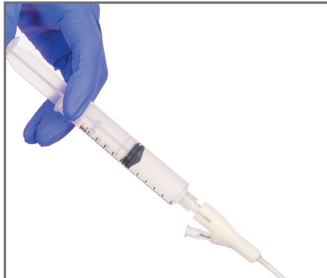
2. Flushing capability for salvage cytology