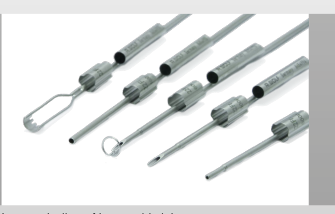
Large selection of laser guide tubes