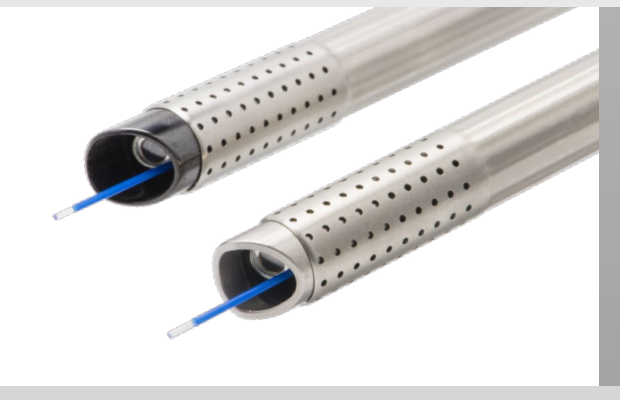
Top: Continuous irrigation laser resectoscope sheath with ceramic tip Bottom: Continuous irrigation enucleation sheath with stainless steel tip