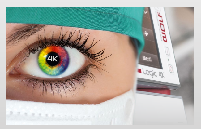
ENDOCAM Logic 4K: The new Sharp. Making the difference in endoscopy.