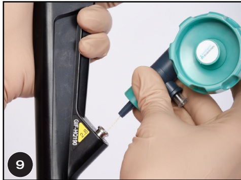
9 Remove handle and attached deployment cord from accessory channel.