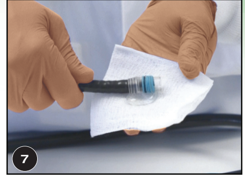
7 Lubricate endoscope and exterior portion of barrel.