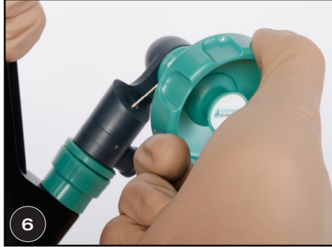
6 Rotate ligation handle slowly to remove the extra slack in the deployment cord.