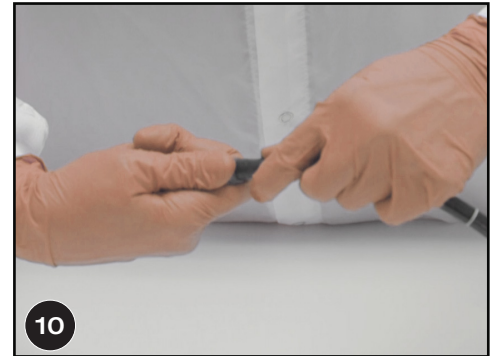
10 Remove barrel by turning in a counterclockwise motion, twisting barrel off the endoscope. DO NOT use excessive force to remove the barrel from the endoscope.

This information is to be used as a reference guide only. Review the instructions for use prior to using the device.